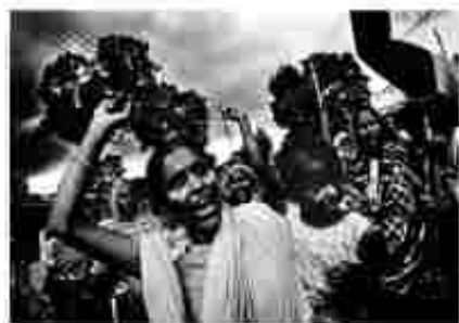
An entire community erupted in protests against a proposed open-cast coal mine project in Phulbari town, in the North-West district of Dinajpur, Bangladesh. Here several dozen women, one with her infant child, are chanting slogans against the proposed coal mine project in 2006.

are now being re-opened to MNCs through the liberalisation of the global economy. The mineral industry's extraction of earth, its use of chemicals, its pollution of waterways and land,