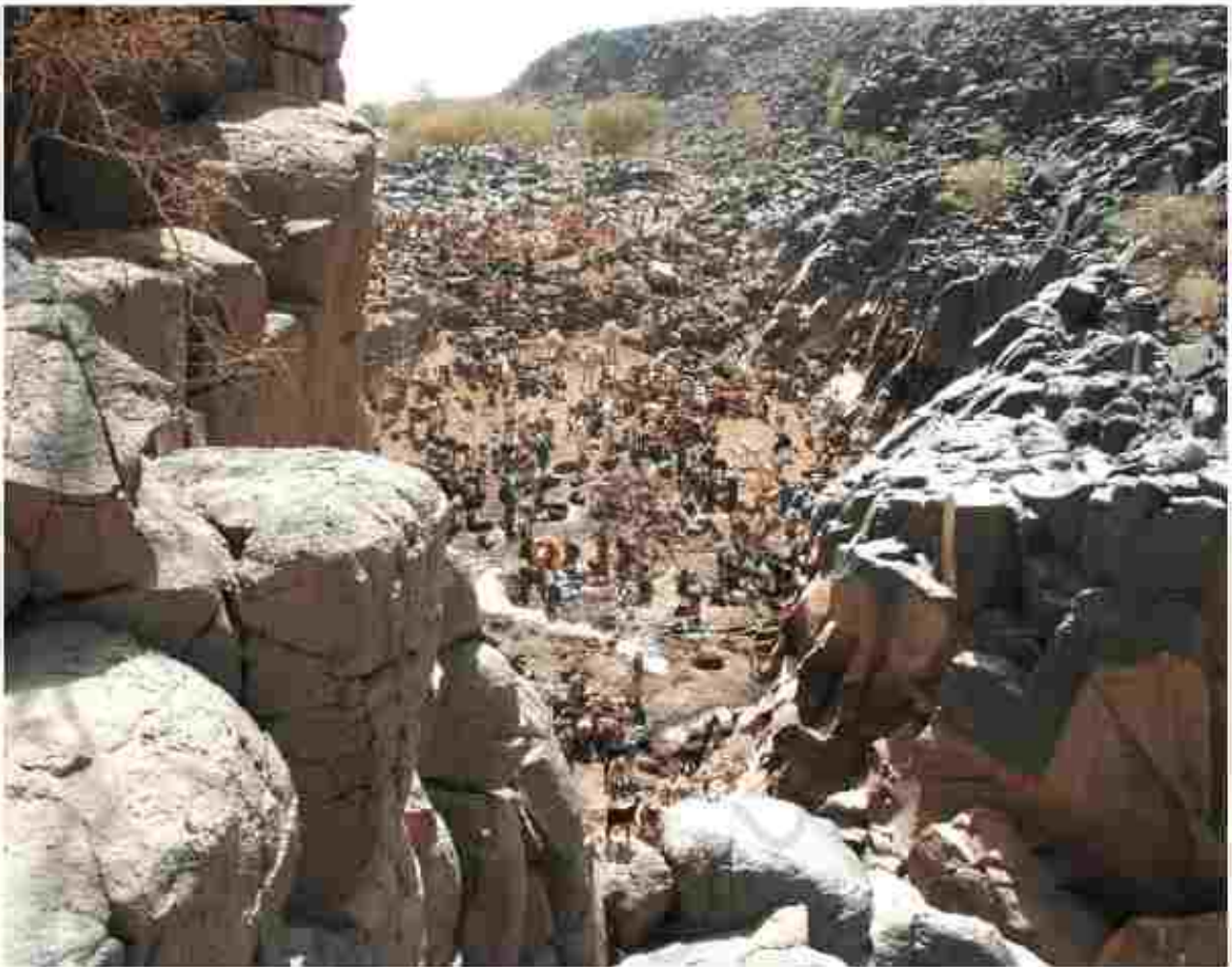
One of the biggest catastrophes in Africa in the 1970s, a drought turned the best cropland in five countries into cracked and barren earth. In fact, the term environmental refugees came into popular vocabulary after this. Many had to flee their homelands as agriculture was no longer possible.

basis of vague scientific evidence and time frames. In that sense the discovery of the ozone hole over the Antarctic in the mid-1980s revealed the opportunity as well as dangers inherent in tackling global environmental problems.